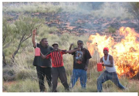
Trainee fire rangers burning spinifex to protect sensitive vegetation on the hills near Angatja.

Draft fire management plans for the Musgrave Ranges and Mann Ranges fire management regions are available below for comment. Comment should be provided by August 15.