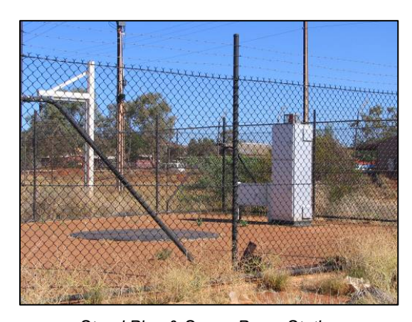
Stand Pipe & Sewer Pump Station

An effluent pump station is located in the community west of the community office (near the power station) and discharges effluent to the wastewater disposal area.