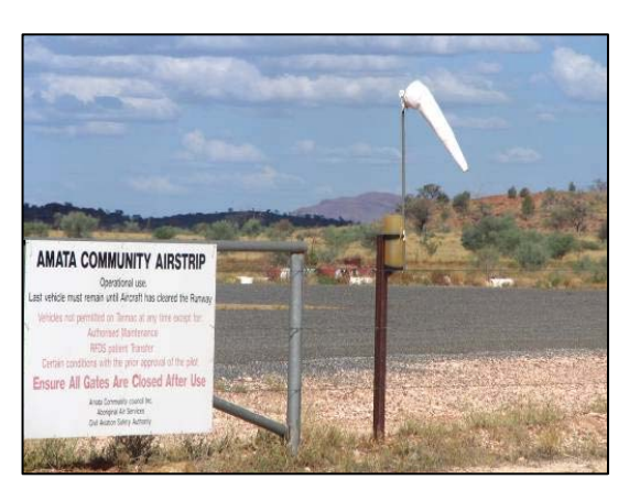
Amata Air Strip

The aerodrome serves the Amata community and eight homelands. The aerodrome is located 9 km from the community and provides urgent medical evacuations, mail services, government and community aircraft charters. It provides essential access as roads to the area become impassable on average 20 times per year due to flooding.