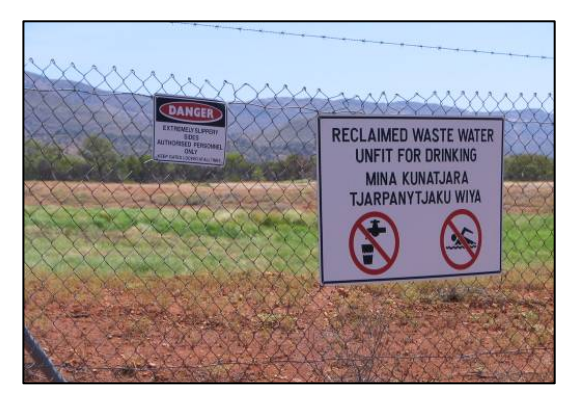
Amata Waste Water Ponds

Based on this data the effluent treatment ponds do not appear to be utilised to their full potential and as such, would appear to have spare capacity to accept additional effluent generated from expansion of the Community.