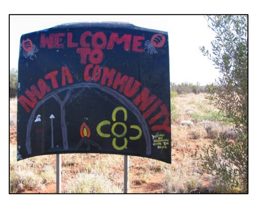
Amata Welcome Sign