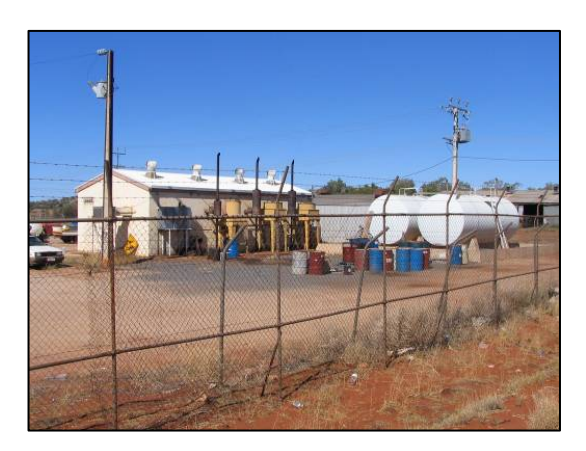
Amata Power Station

According to the base plan information provided by SKM, a site visit and advice, the Community owns an electrical generation and distribution system. ETSA Utilities is the licensed operator for generation. The community receives essential services support grants from Department of Aboriginal Affairs and Reconciliation to assist the day to day management of their primary infrastructure. The grant is for the purchase of diesel fuel, lubricating oil, for the specific purpose of power generation and the essential services officer's salary.