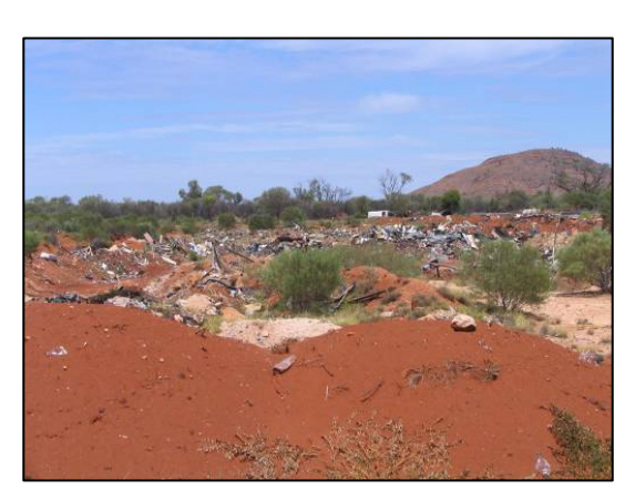
Amata Waste Management Area

The waste management area is located a short distance from the community, past the sewerage ponds. There is no secure fencing to control where rubbish is dumped although it tends to be in a pit 3 to 4 m deep. The waste management area is filled from time to time, but domestic rubbish is left uncovered for extended periods. The waste management area does not have an impact on water source protection, but could benefit from improved management. It would also be beneficial to secure parts of the area and ensure dumping takes place in designated areas.