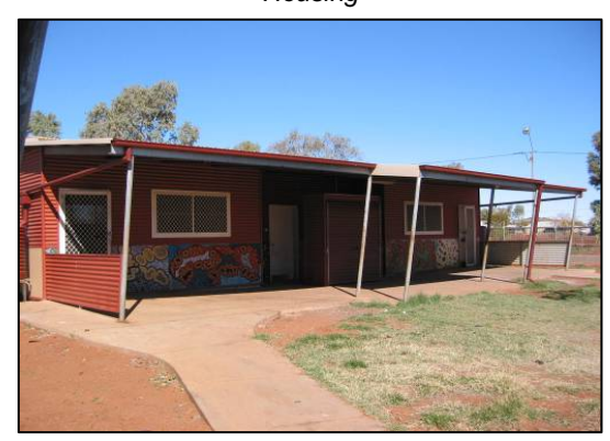
Aged Persons Housing