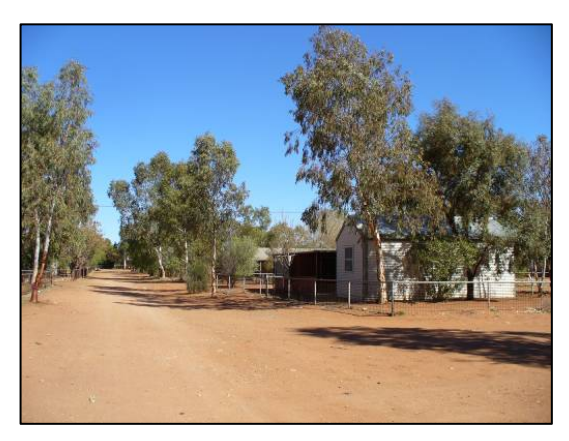
Laneway between houses

The central access lane has a width of approximately 10 metres and provides access to the rear of the houses. Fences and landscaping assist in controlling vehicle movements and containing it to the existing road network.