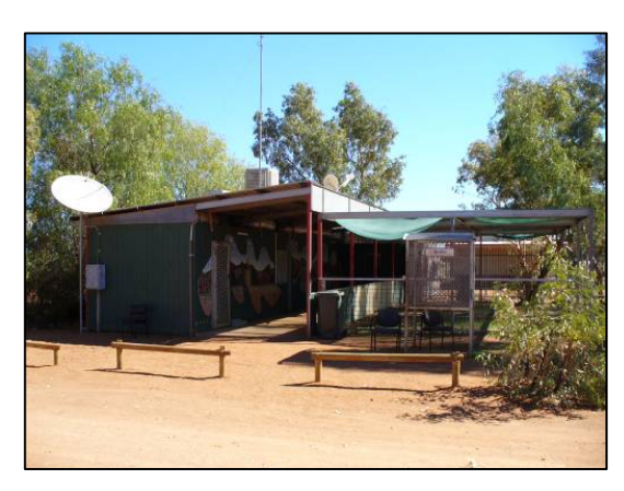
The administration building

It is unlikely that funding would become available in the foreseeable future to allow the football and softball ovals to be grassed and provided with lighting. As such it is proposed that these facilities could be relocated to the southern side of the main access road to reduce the problems of dust from the prevailing east west winds.