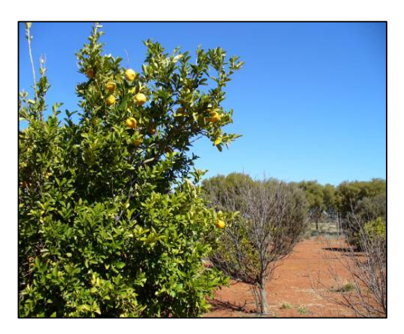
Citrus plantings in the community garden

The community garden is maintained through the CDEP programme.