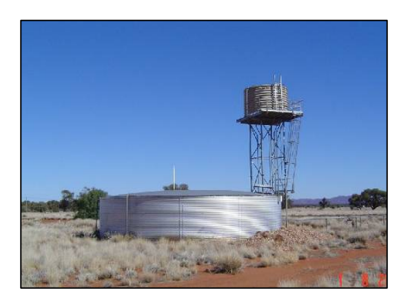
Water storage tanks and new electric bore

A windmill bore is located north-east of the community.