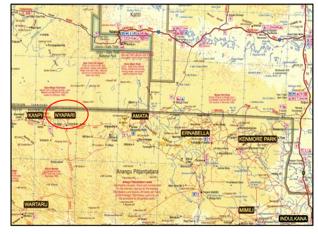
Location Plan

The people living in Nyapari are mainly Pitjantjatjara people, and Pitjantjatjara is the main language spoken at home and