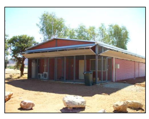
The Nyapari Health Clinic

The health clinic based at Nyapari is shared with Kanpi. A nurse provides general medical services to the community. The closest major health facility is approximately 100 km away, at either Amata or Pipalyatjara. The clinic is operated by Nganampa Health.