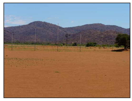
The football oval

Community members have already initiated a successful tree planting program which provides shade and some protection from winds. It is anticipated that this will be expanded over the next few years to outer housing areas.