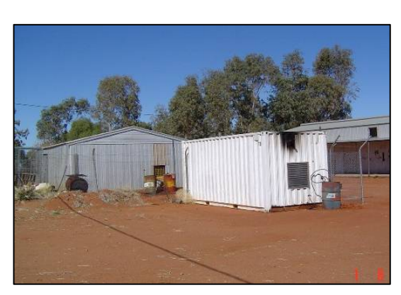
Nyapari power generation compound

Power is distributed through the community by aerial bundled cable on standard ETSA Utilities stobie poles. Property connections are generally underground. Power is also fed by HV cable to Murputja. This cable also provides power to a Telstra fibre optic hut.