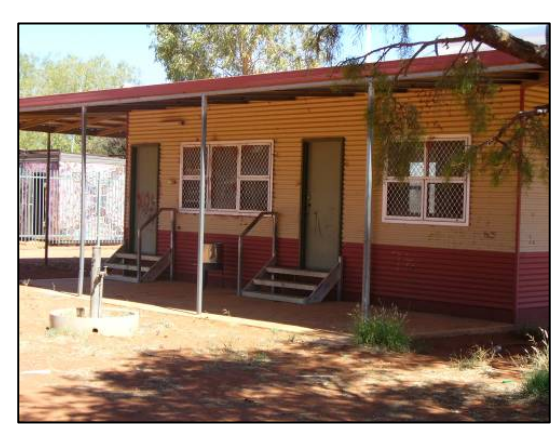
The arts and crafts centre

The Arts and Crafts Centre is located to the rear of the office. Art and craft is produced within the community by a number of women and some men from the community who come to the craft centre to work.