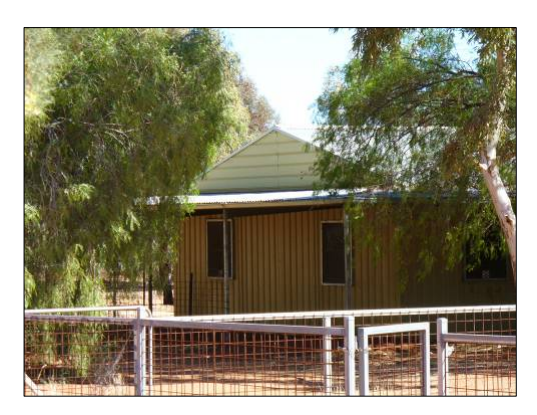
Typical community house

Nyapari is laid out on grid pattern, but with some disconnected roads with pedestrian short cuts. House sites are mostly rectangular and have areas of approximately 900-1,000m<sup>2</sup> with frontages of 30-35m.