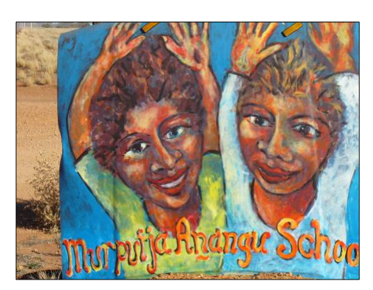
Welcome sign for Murputja School

Murputja Education Centre, which is located six kilometres west of Nyapari, was established in 1993 and services the Homeland communities of Nyapari, Kanpi, Umpukulu, and Angatja. The school is situated at Putu-ngapa (at the foot of the Mann Ranges), in between the four homeland communities it services. Each day a bus takes children from Nyapari, Kanpi and other smaller outstations to Murputja School. The school teaches children from pre school up to year eleven.