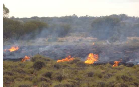
This patch burn was lit to reduce spinifex fuel around Nganamara habitat in the Walalkara IPA. On a cool day, fires move slowly into the wind or burn back on themselves and usually self extinguish at night.

It is vital that APY Land Management is funded to support Anangu to continue and expand on these burning programs in the future. There is a