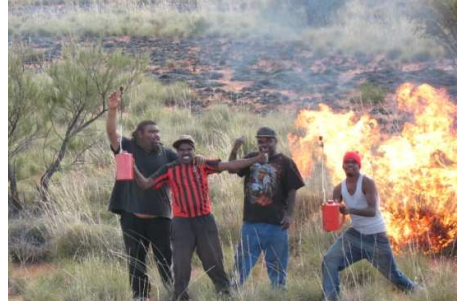
Trainee fire rangers burning spinifex to protect sensitive vegetation on the hills near Angatja.

Draft fire management plans for the Musgrave Ranges and Mann Ranges fire management regions are available below for comment. Comment should be provided by August 15.