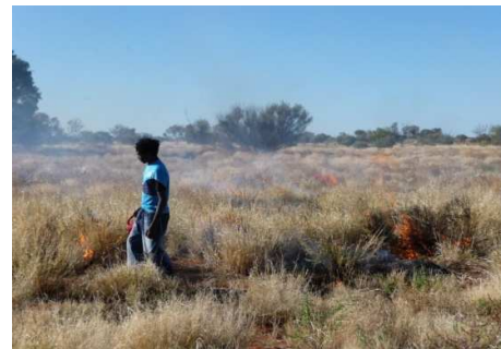
Warru Ranger, Sharada Stanley, burning introduced buffel grass in an attempt to reduce fuel loads around the endangered Warru (black flanked rock wallaby) colony.